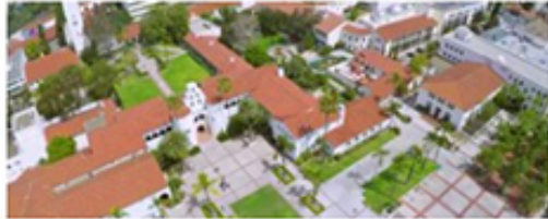
Aerial Tour of San Diego State University Published: May 10, 2018 | Views: 1,291