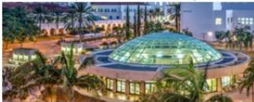
More than 93,000 Apply to SDSU Published: Dec. 18, 2017 | Views: 2,565