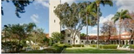
SDSU Rises in Recent National Ranking Published: Mar. 28, 2018 | Views: 3,471