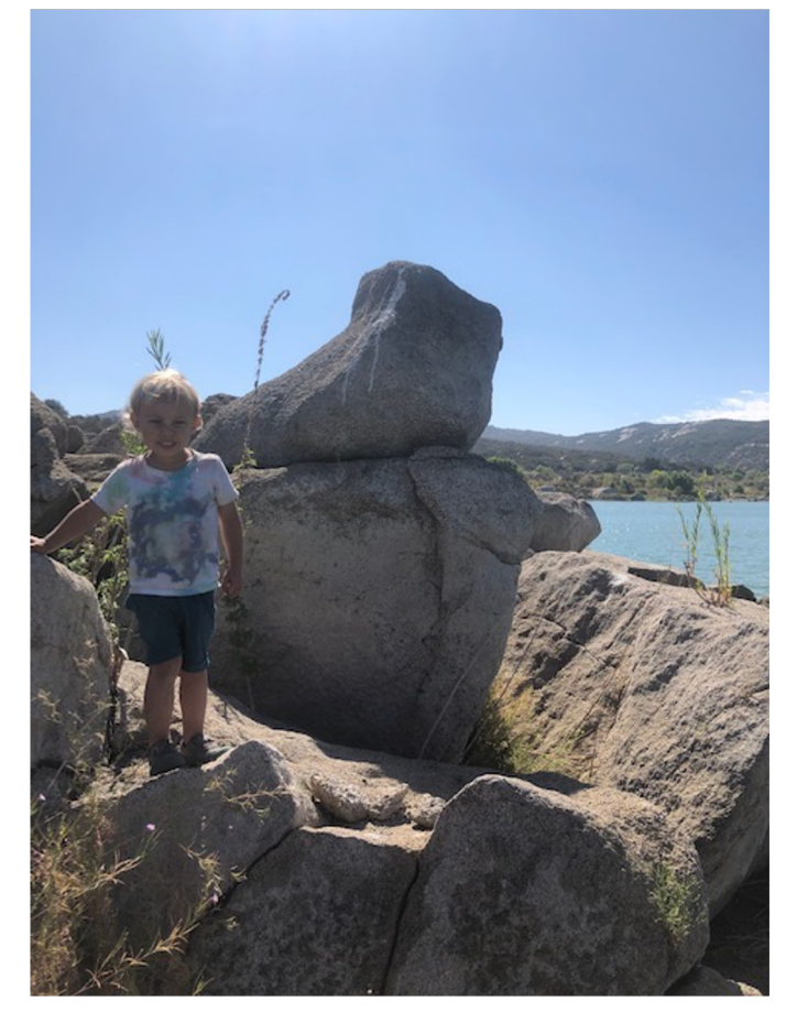
Tyler's son at Lake Morena County Park, October 12th 2020